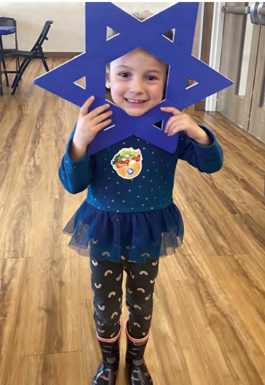
At the PJ Library’s Happy Birthday Israel event, families celebrated with lots of games and activities for children and families.