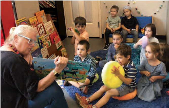
Students at NEJA engage in innovative learning through the renowned Reggio Emilia curriculum.