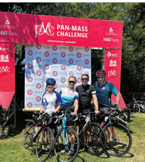
The Rosow team at the Pan Mass Challenge 2023, Provincetown finish.