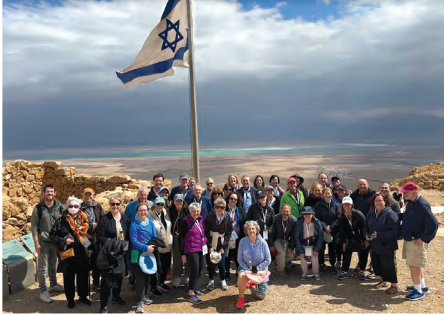
Participants on the Jewish Federation’s 2023 Mission to Israel pose for a photo on Masada overlooking the Dead Sea. The Foundation provided travel scholarships for five senior Jewish agency professionals.