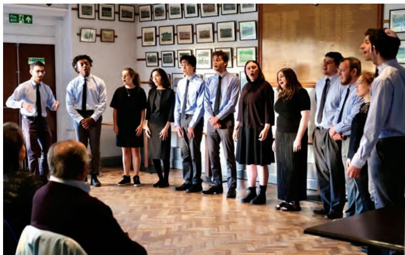
Magevet, Yale University's a cappella singing group devoted to Jewish, Hebrew and Israeli music, is now supported by the Magevet Endowment Fund at the Foundation.