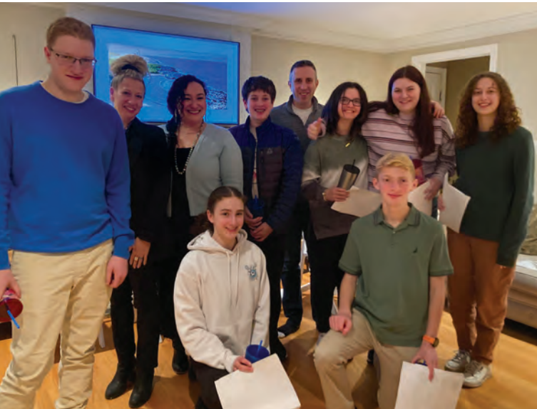
JTConnect Teen Philanthropy students gather at a recent Teen Leadership Philanthropy Institute Parents' Night.

When the Foundation launched its Springboard Grant in 2019 to trigger transformative growth for Jewish organizations, JTConnect received the inaugural $120,000 three-year grant. The investment allowed the Executive Director to spend more time on fundraising, board development and engagement, and strategic planning. It also funded a new staff member who took over some of the Executive Director's administrative duties.