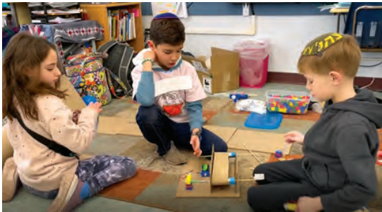
Schechter students test their conveyor belt invention for the school's Purim STEAMfest, which emphasizes Jewish learning through science, technology, engineering, arts and math. The trial and error phase helps students learn from mistakes and improve their designs.