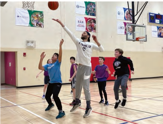
Thirty students (grades 3-8) learned some new moves on the court from Israel superstar and former UCONN Husky, Doron Sheffer, during a basketball clinic at the Mandell JCC.