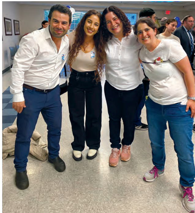
Community members mark the transition from Yom Hazikaron (Israel Memorial Day) to Yom Haatzmaut (Israel Independence Day) at New England Jewish Academy.